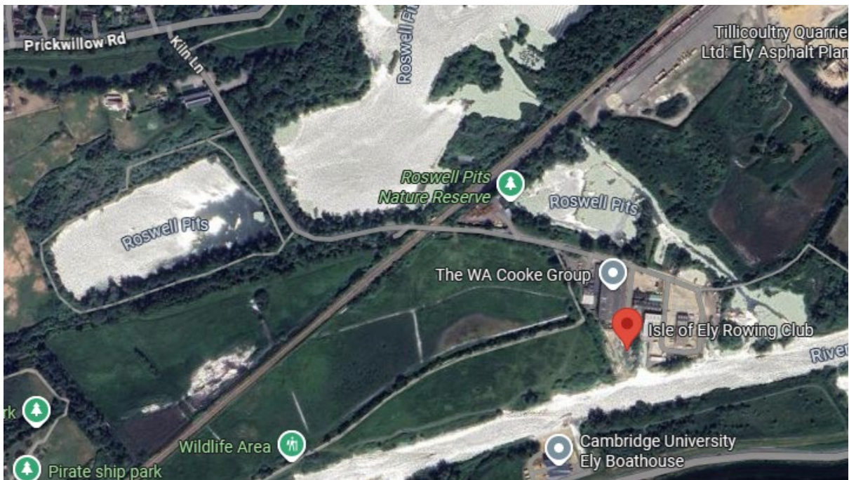
Figure 1: The IoERC site.

Once you're on Kiln Lane follow it down over the level crossing (slowly – there are quite a lot of potholes) and there is a car park on the right. From the car park, follow the footpath to the right of the low brick offices (not the low-level public footpath). You should see a gate with the IoERC name on it.